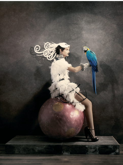
Untitled (Parrot), 2008 Pigment print on cotton Fine Art paper, 40 x 30 cm © Giovanni Gastel