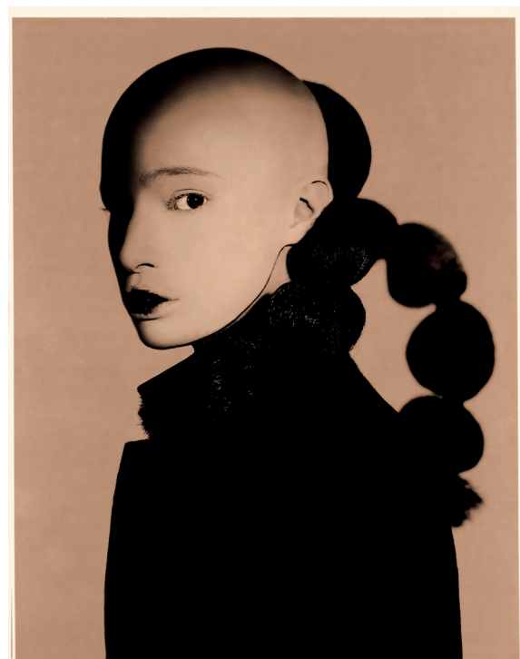
Untitled, Milano, 2007

« I'VE ALWAYS ESTABLISHED TIES BETWEEN POETRY AND PHOTOGRAPHY, AND FOUND CERTAIN CHARACTERISTIC ELEMENTS OF MY LOVE FOR POETRY THROUGH PHOTOGRAPHY: THE CONCISENESS, THE NECESSITY TO CONCENTRATE ALL INTERPRETATIONS WITHIN A BRIEF IMAGE CHARGED WITH A CERTAIN SENSIBILITY... I TRY TO DO POETRY THROUGH MY PICTURES. »