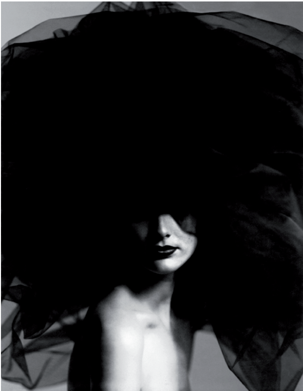
— Shalom, 1990 Pigment print on cotton Fine Art paper, 180 x 150 cm © Giovanni Gastel