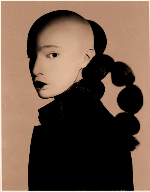
Untitled, Milano, 2007 (Genesi nello spazio) Pigment print on cotton Fine Art paper