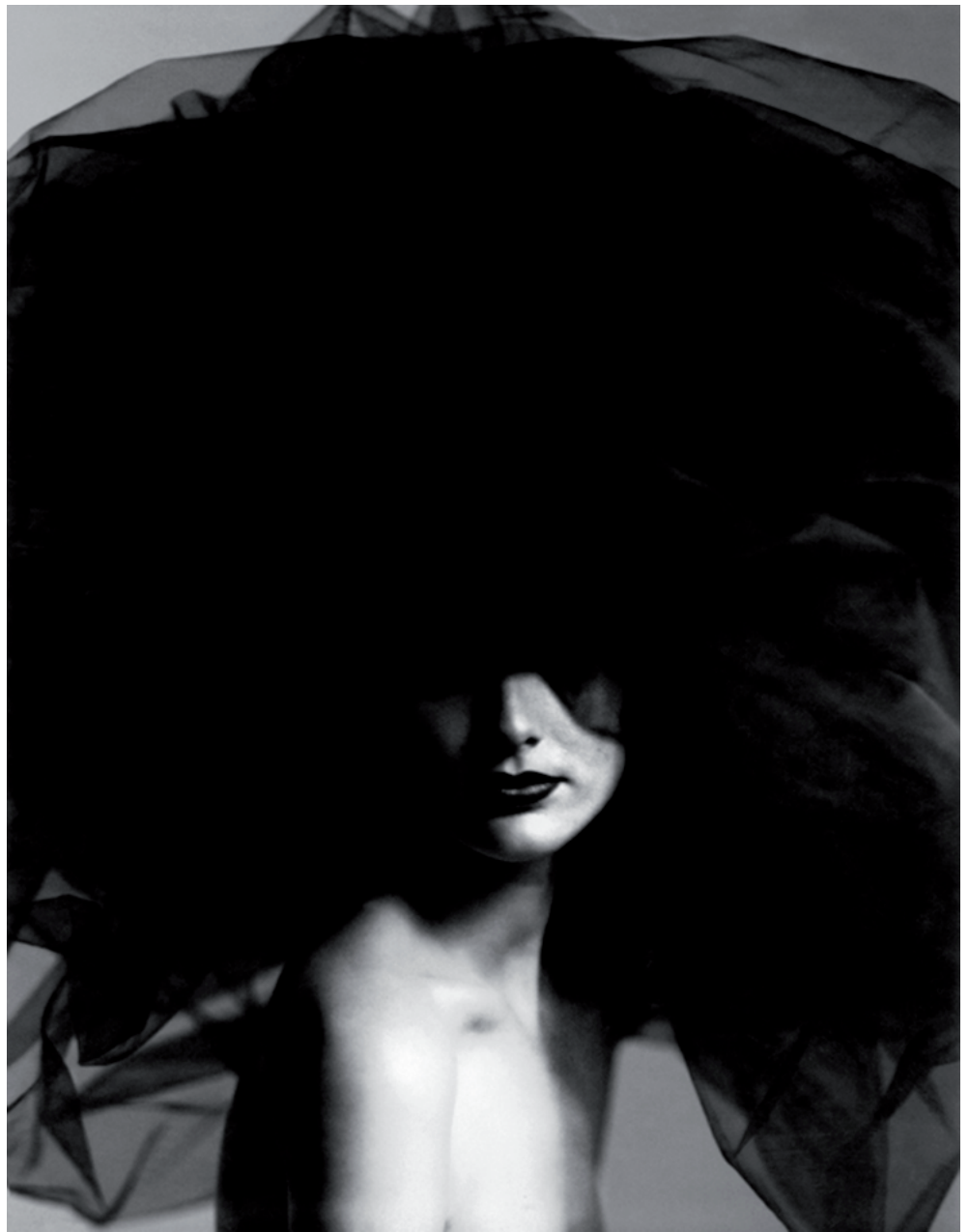
Shalom, 1990 © Giovanni Gastel