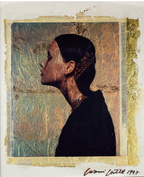
Untitled, 1997 Polaroid film and gold leaf on paper, 25 x 20 cm, unique © Giovanni Gastel