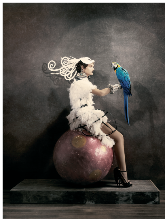
Untitled (Parrot), 2008 © Giovanni Gastel

The exhibition brings together thirty iconic prints around a central theme: the woman.